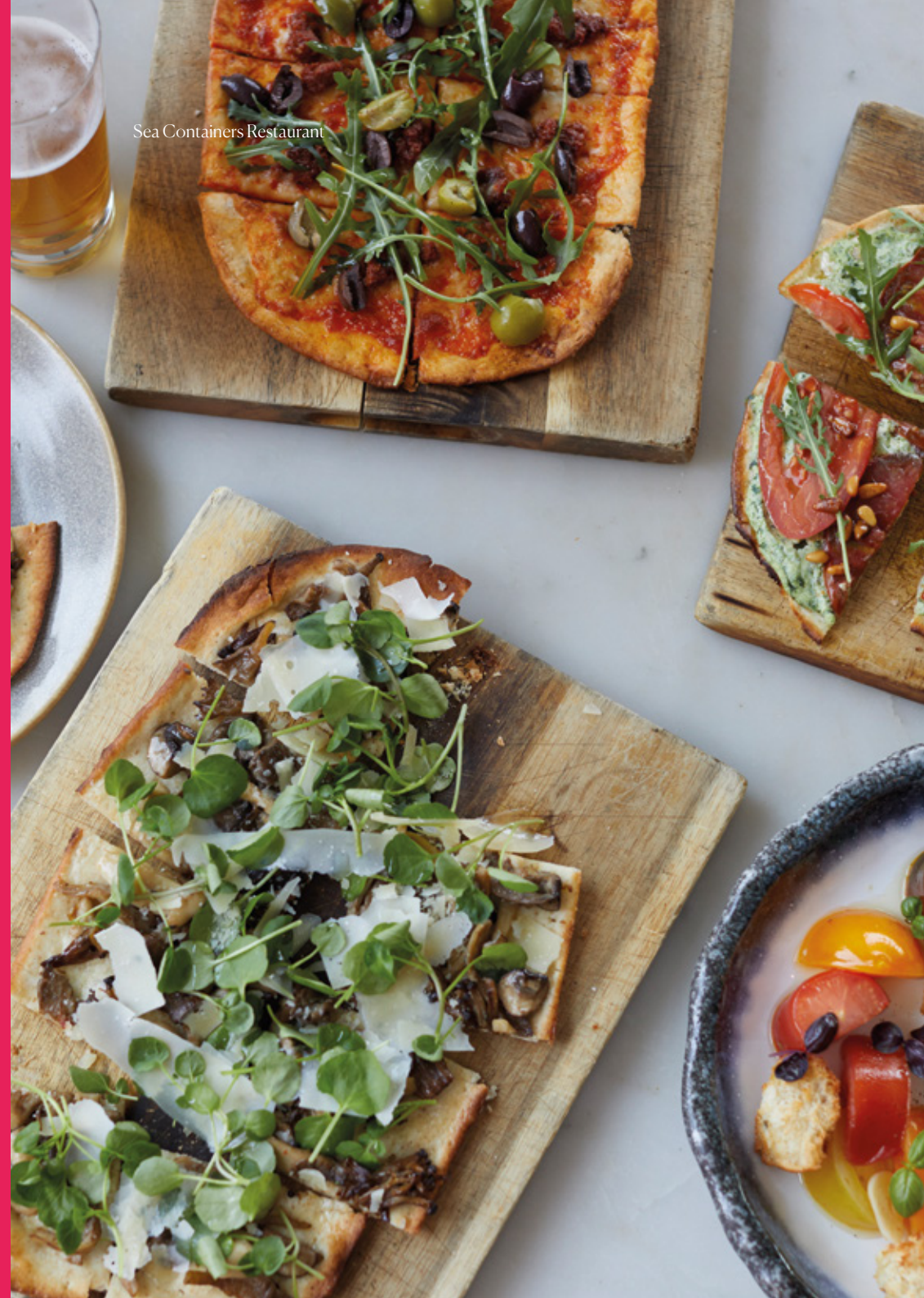
Sea Containers Restaurant

There's an argument to suggest you won't need to.