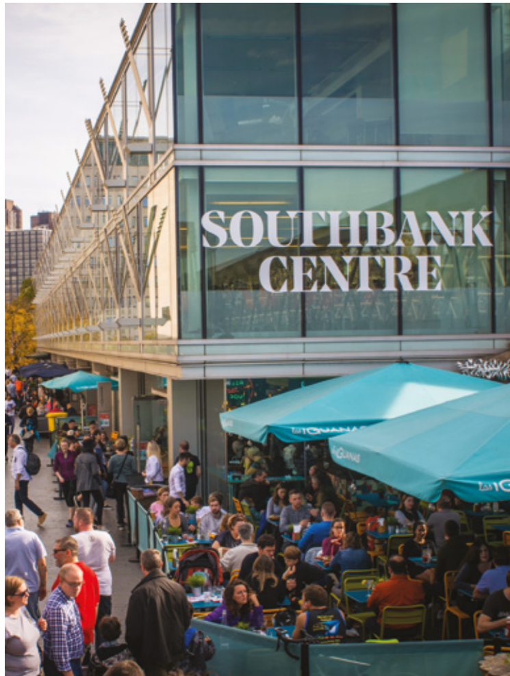
The Southbank Centre — 9 minute walk