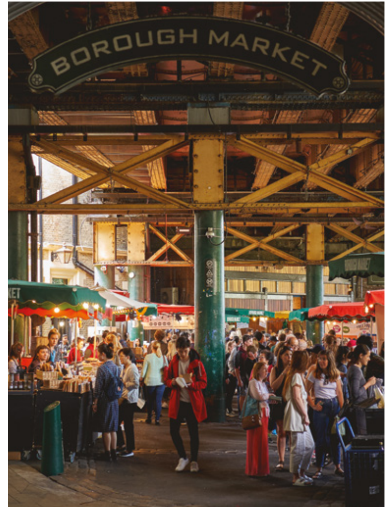
Borough Market — 17 minute walk