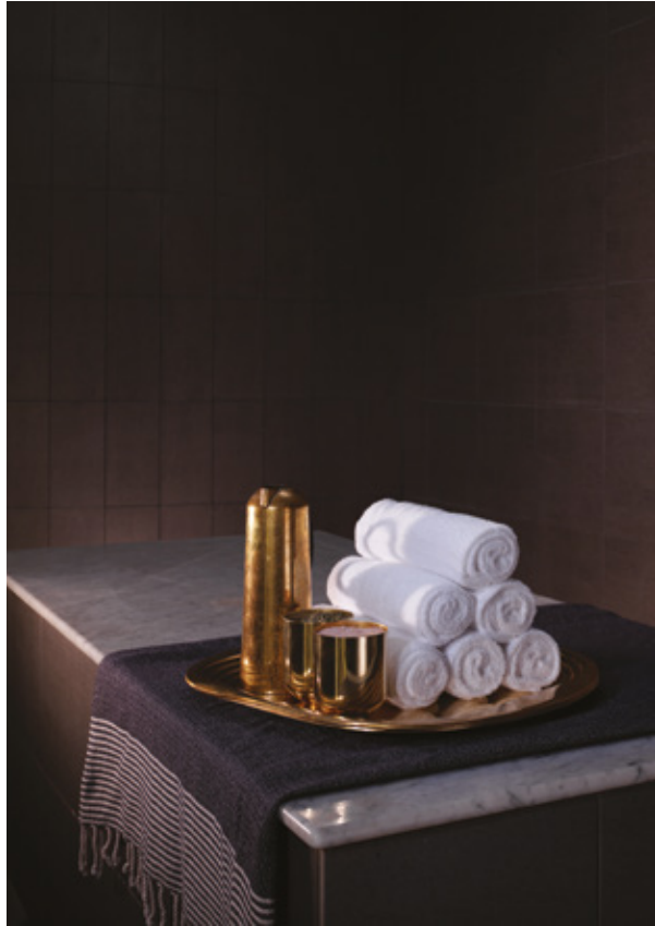
Spa Mud Room