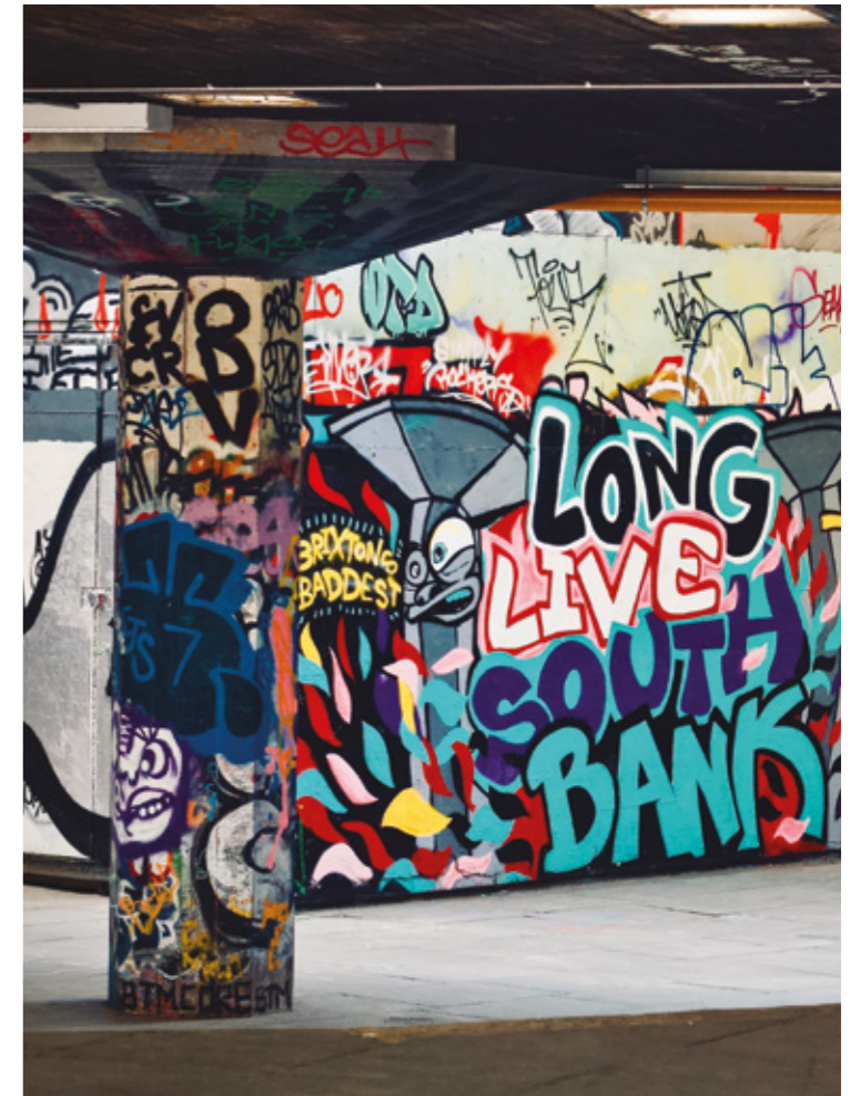
Southbank Skate Space — 11 minute walk