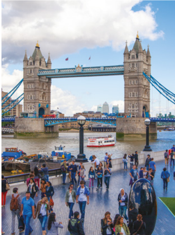
Tower Bridge — 30 minute walk