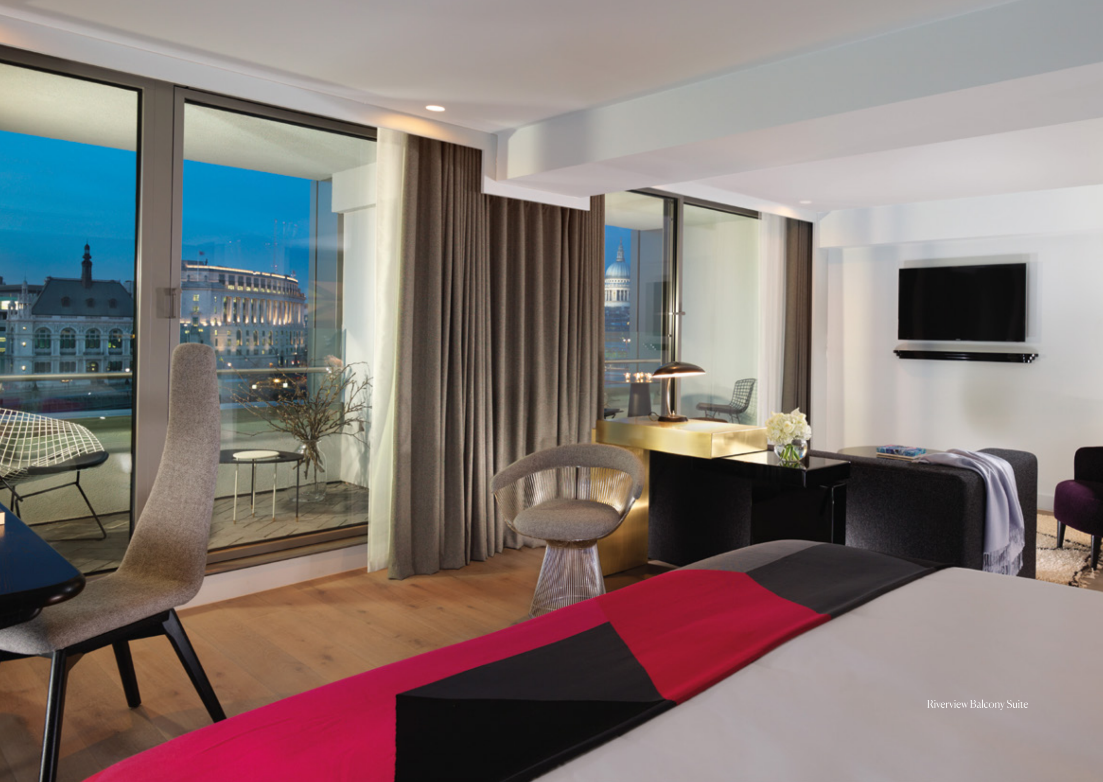
Riverview Balcony Suite