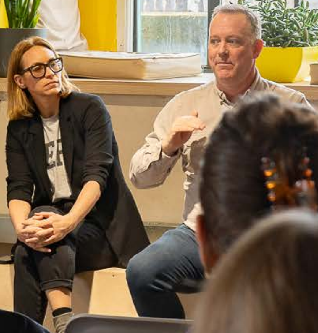
The View - Workshop FuturePlus