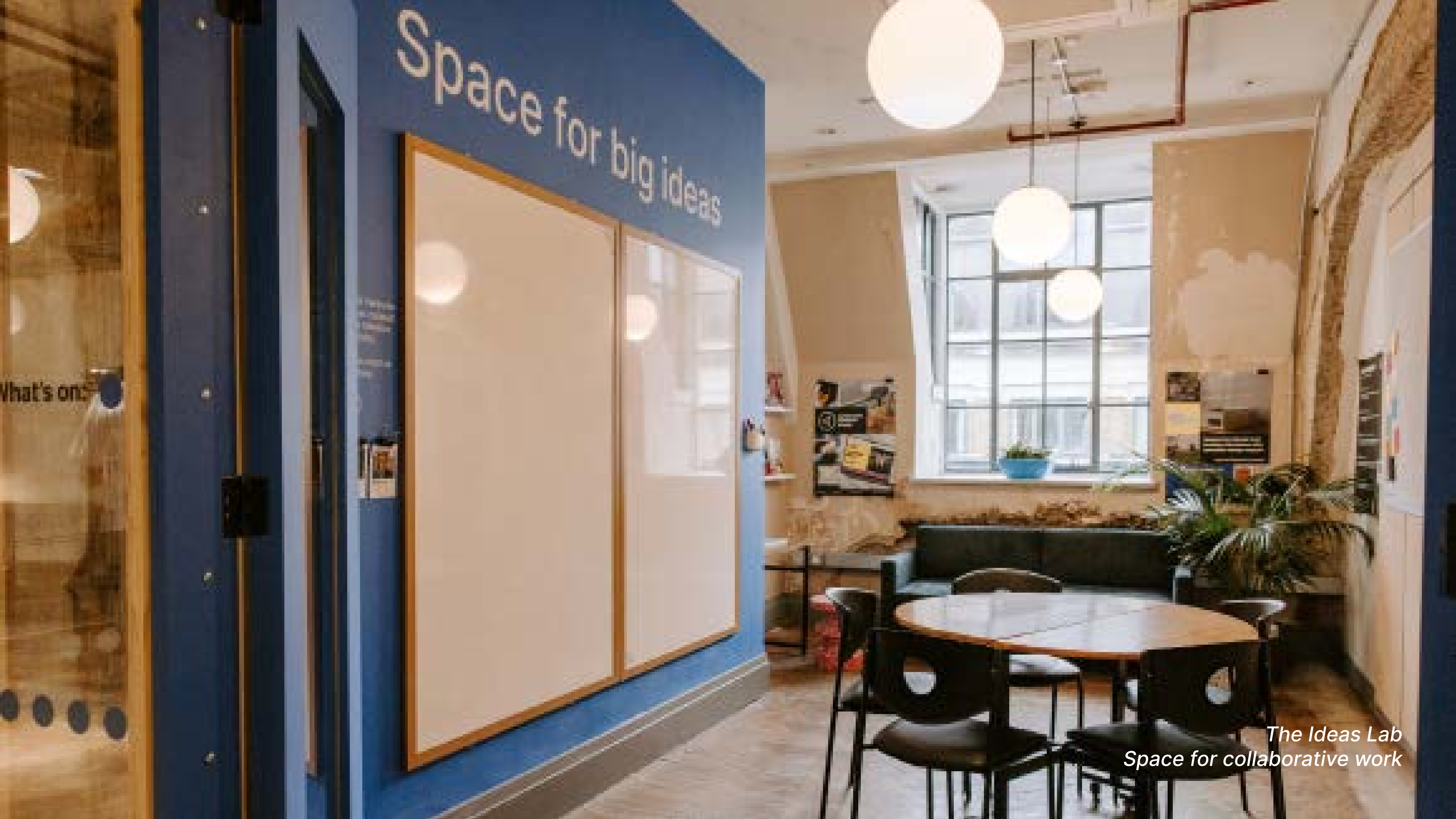
The Ideas Lab Space for collaborative work