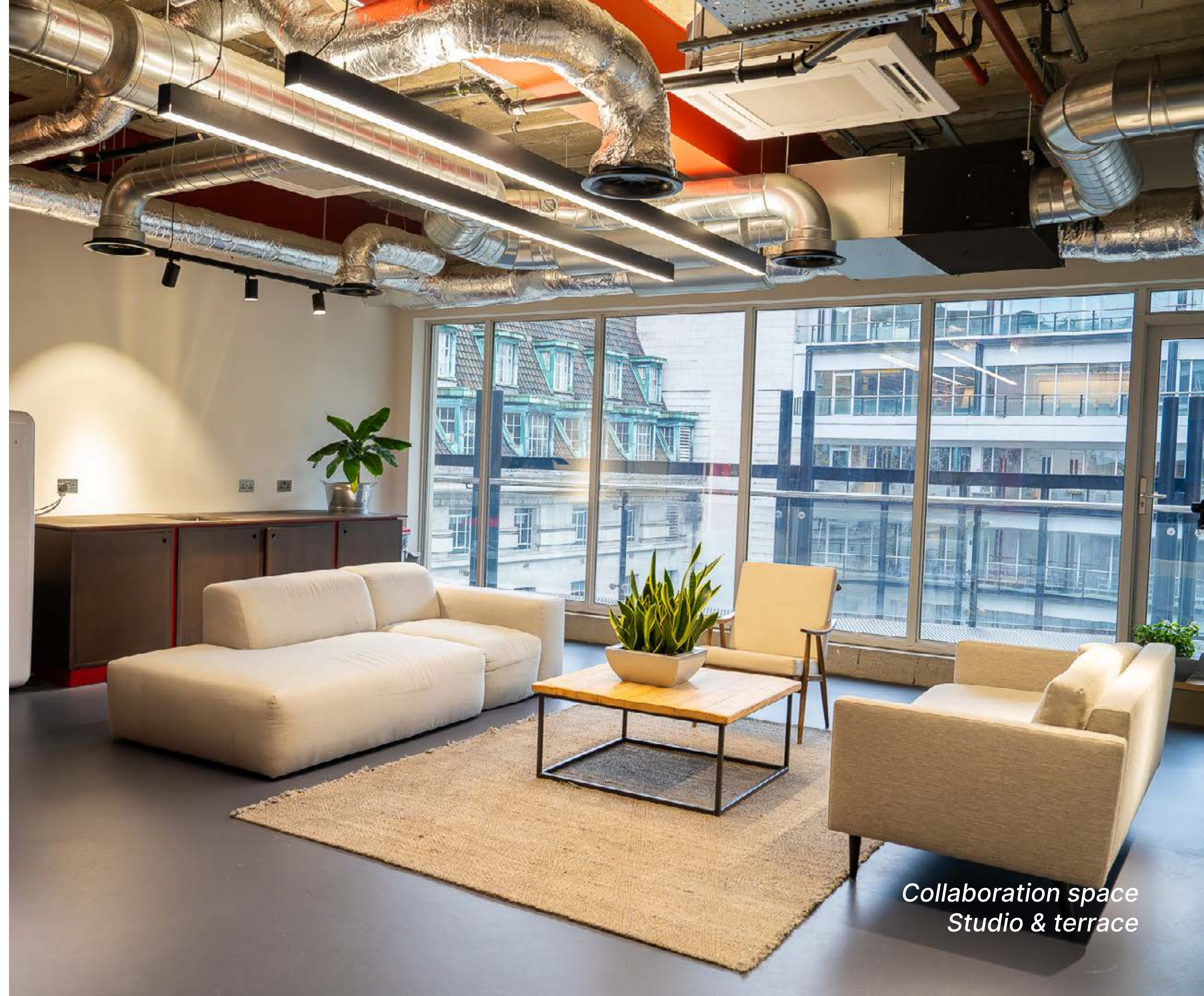
Collaboration space Studio & terrace