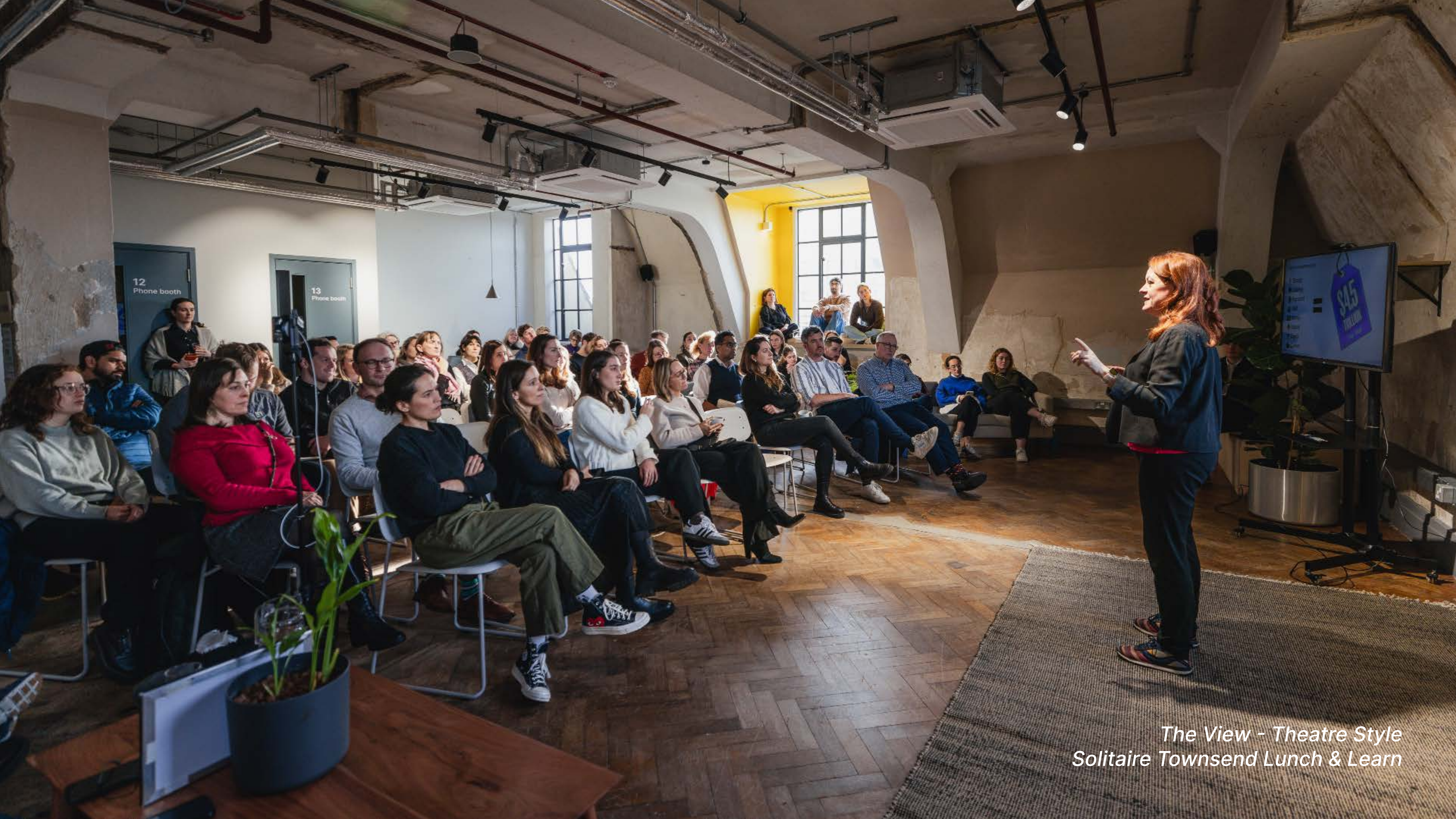
The View - Theatre Style Solitaire Townsend Lunch & Learn