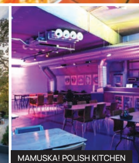
MAMUSKA! POLISH KITCHEN