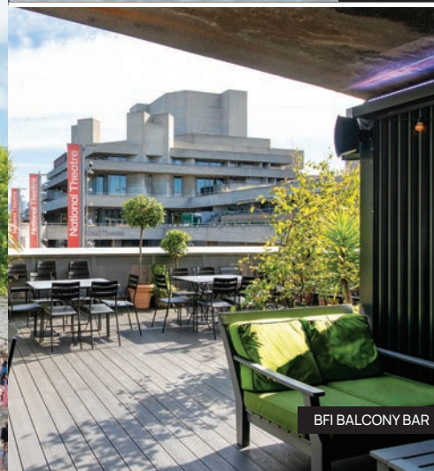
BFI BALCONY BAR