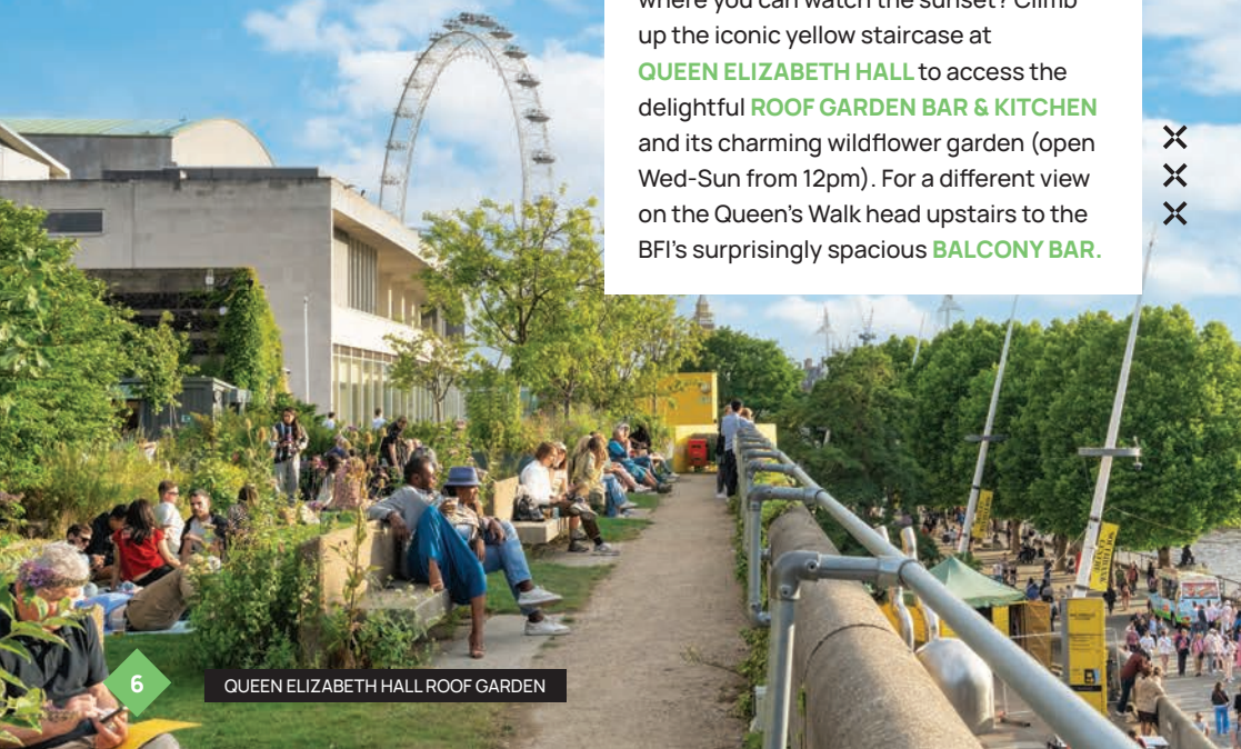
QUEEN ELIZABETH HALL ROOF GARDEN

Looking for a peaceful slice of nature where you can watch the sunset? Climb up the iconic yellow staircase at QUEEN ELIZABETH HALL to access the delightful ROOF GARDEN BAR & KITCHEN and its charming wildflower garden (open Wed-Sun from 12pm). For a different view on the Queen's Walk head upstairs to the BFI's surprisingly spacious BALCONY BAR .