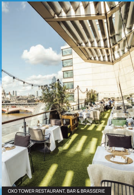
OXO TOWER RESTAURANT, BAR & BRASSERIE

Raise a toast to London's glorious summer sunsets with cocktails on a riverside rooftop.