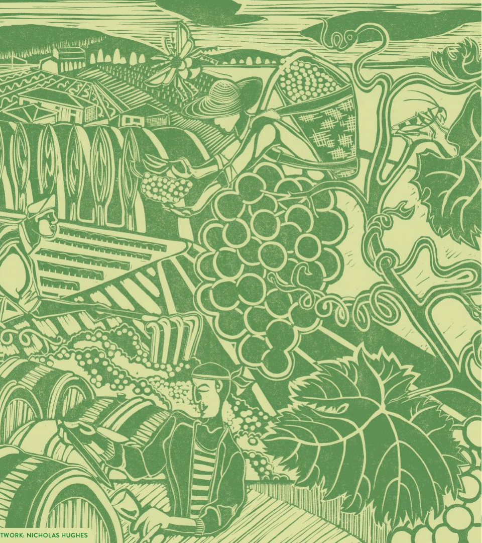
WORK: NICHOLAS HUGHES