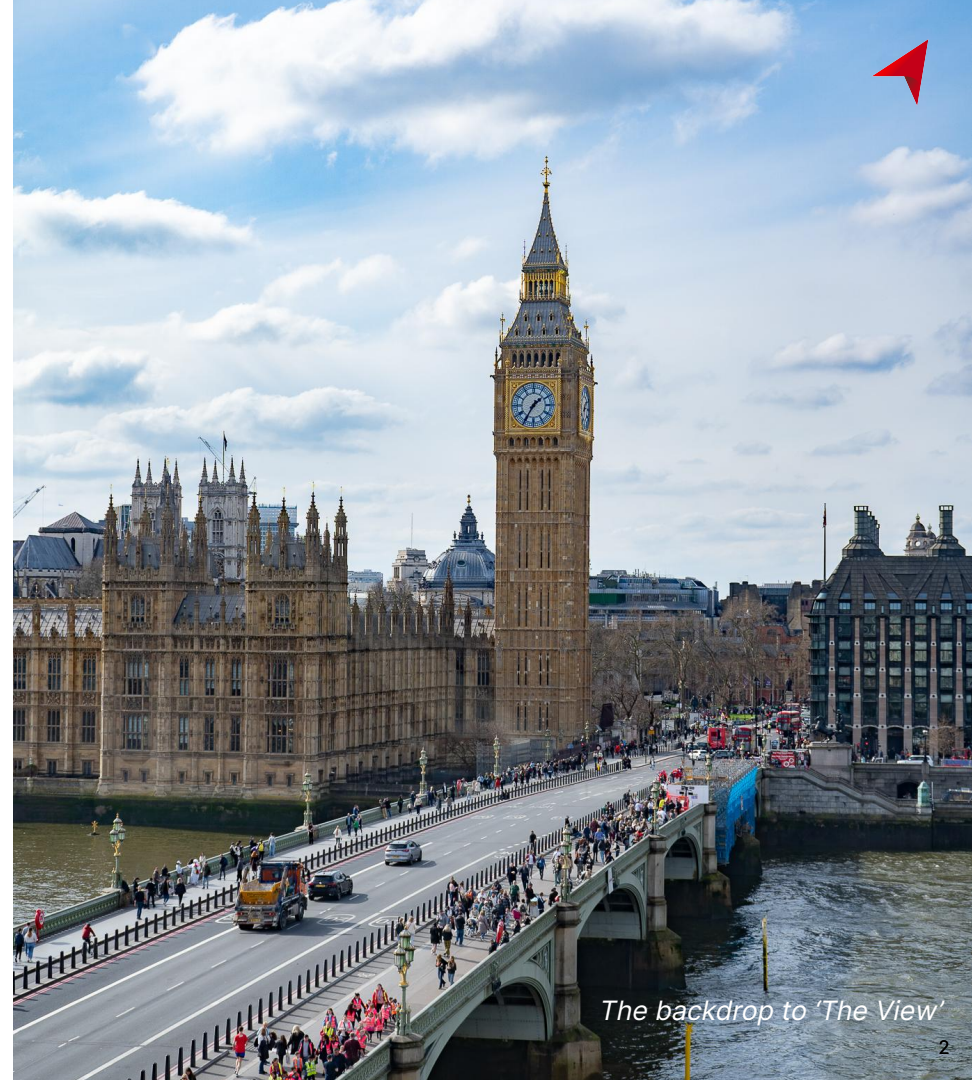
The backdrop to 'The View'

These are guide prices. Contact us for a bespoke event proposal today.