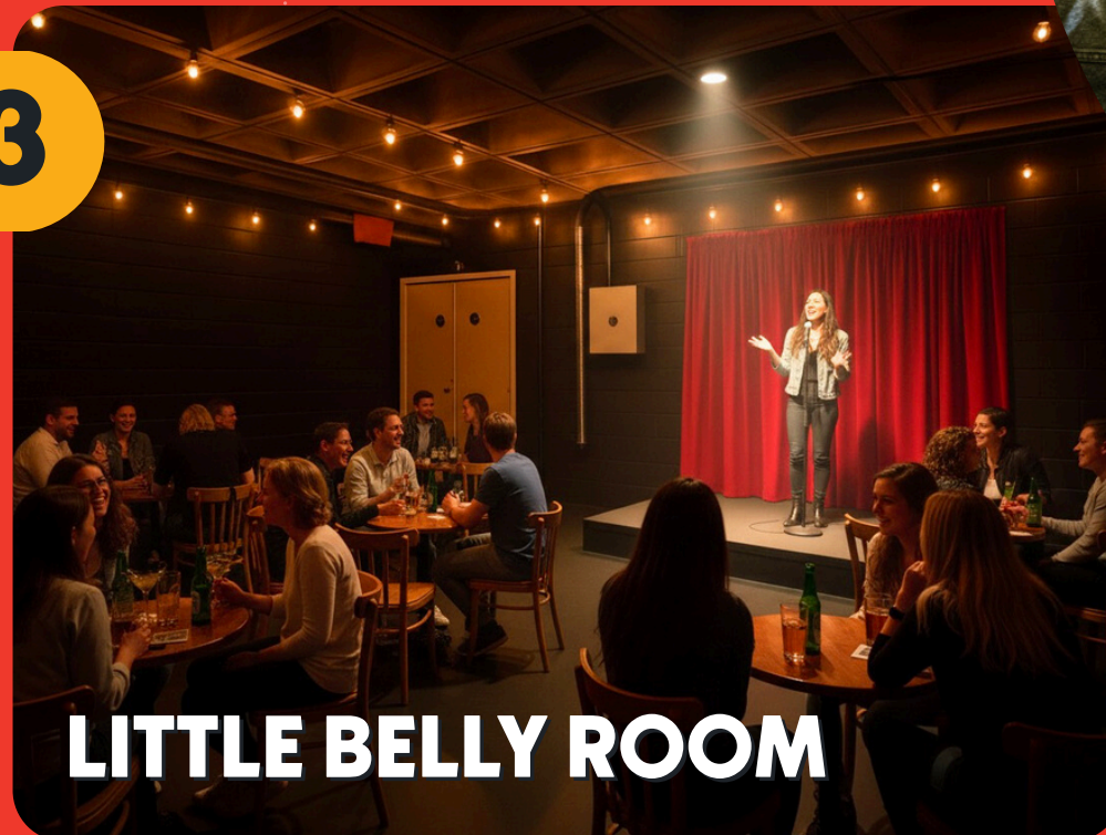
LITTLE BELLY ROOM