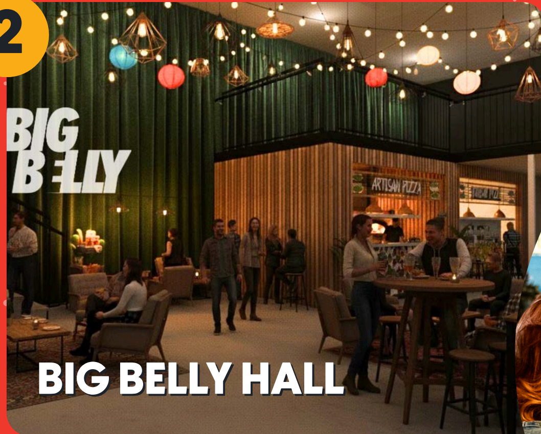
BIG BELLY HALL