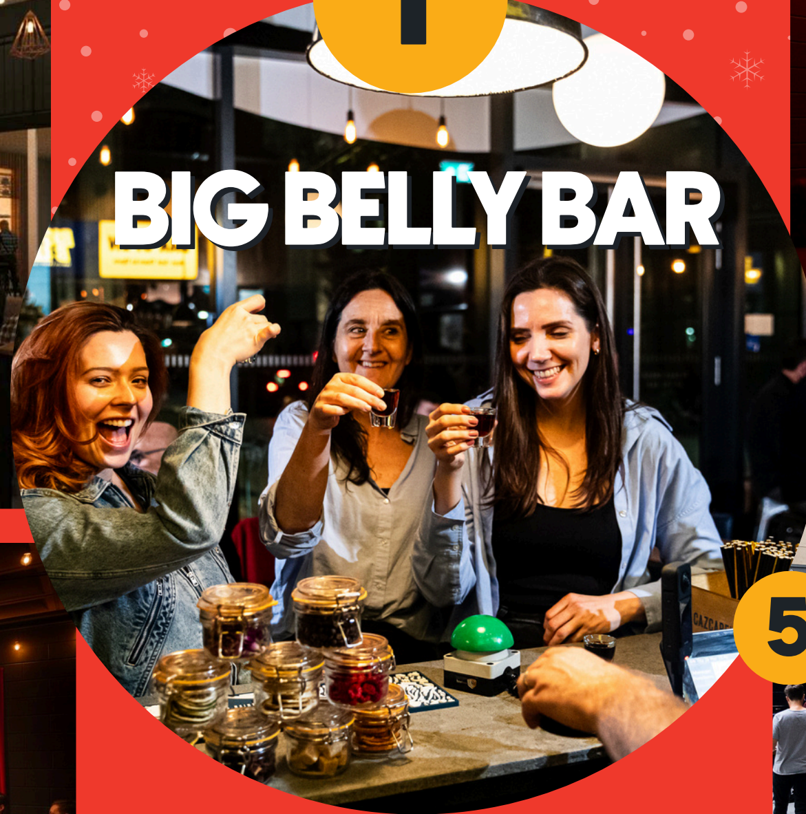
BIG BELLY BAR