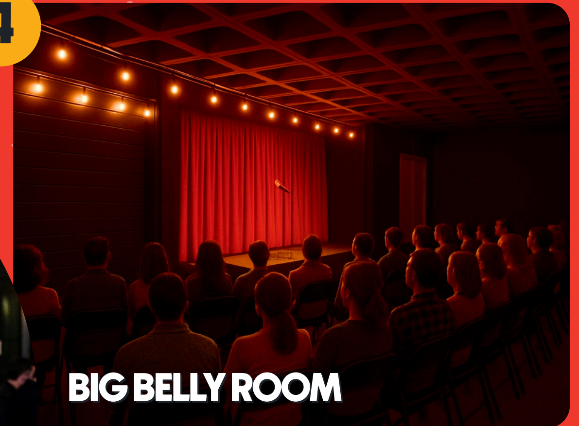
BIG BELLY ROOM