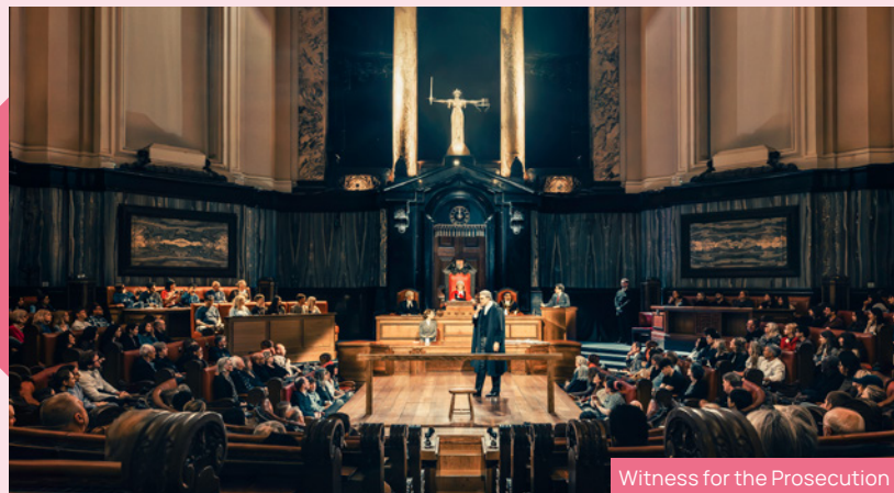
Witness for the Prosecution

Through photos, paintings, textiles, books, and correspondence this enchanting exhibition at the Garden Museum explores the lives and garden sanctuaries of the influential 'Bloomsbury Group' women. → Until 29 Sep. Open daily.