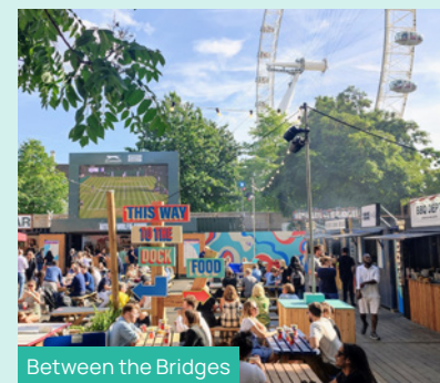
Between the Bridges