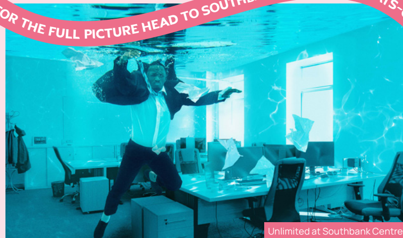
Unlimited at Southbank Centre

FOR THE FULL PICTURE HEAD TO SOUTHBANK.LONDON/WHATS-ON