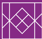
BANKING HALL CORNHILL