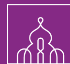
VICTORIAN BATH HOUSE BISHOPSGATE